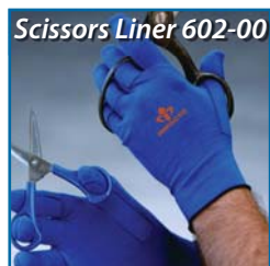
Scissors Liner 602-00

Neoprene pad in the back of fingers, mesh back