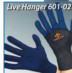
Live Hanger 601-02

3/16" pad in palm, knuckles and back of hand