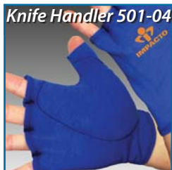
Knife Handler 501-04

Soft leather, padded palm, edge and back of hand