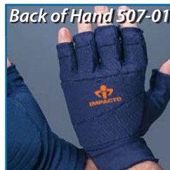
Back of Hand 507-01

Reduces pressure of knife handle on palm and thumb