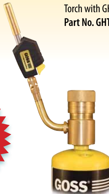
Torch with GHT-TL Piezo Lighter Tip Part No. GHT-100L