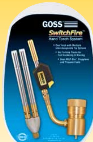
Kit with GHT-100L & GHT-T2 Twin Tip Part No. GHT-KL2