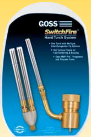
Kit with GHT-100 & GHT-T2 Twin Tip Part No. GHT-K12