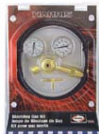
Part No. 4400229