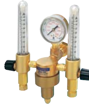
Part No. 3100140