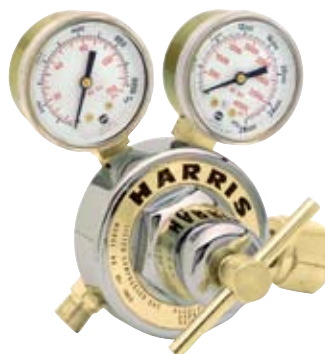
Part No. 3000510