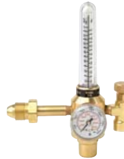
Part No. 3100200