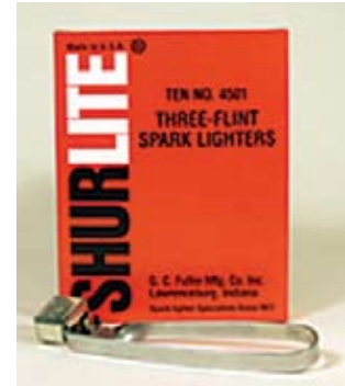
Part No. 4501