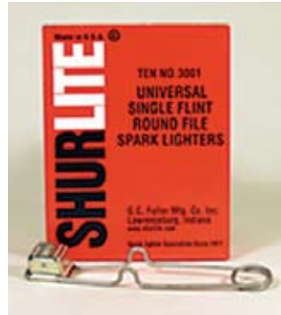
Part No. 3001