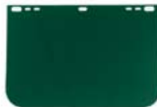
Part No. 932-824BDG