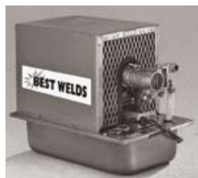
Part No. VC2500SS