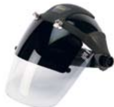
Part No. MPH-F8