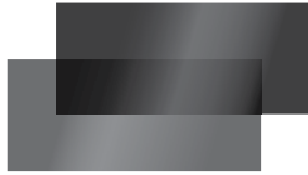
2" x 4.25" filter plates