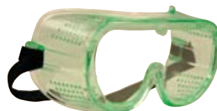
Part No. 932-1