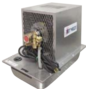
Part No. VC3500SS