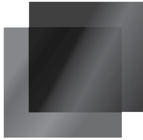
4.5" x 5.25" filter plates