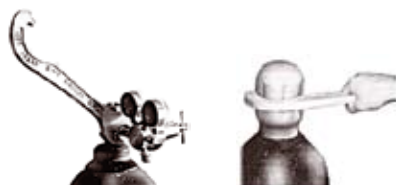
Part No. 1027

Combination wrench 9" long has a total of 10 openings from 7/16" to 1-1/8" including a boxed opening for B and MC acetylene valves and a socket for commercial acetylene cylinders.