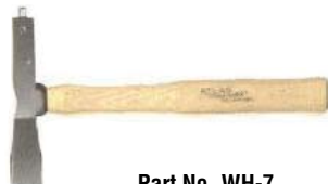
Part No. WH-7

Part No. 0026 - 13" Wood handle and wedge for long neck