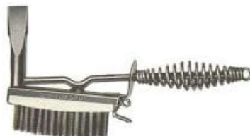
Part No. 000A