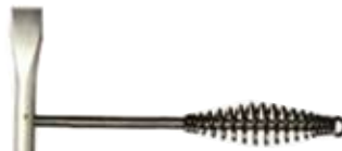
Part No. 000H