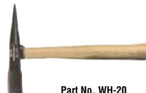
Part No. WH-20