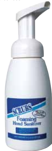
Part No. 92908