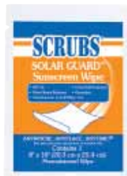
Part No. 91201