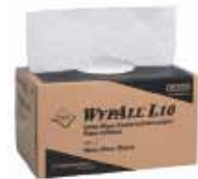
Part No. 05320

Part No. 05322 - Pop-Up 12" x 10.5", qty 125/bx; 18bx/cs