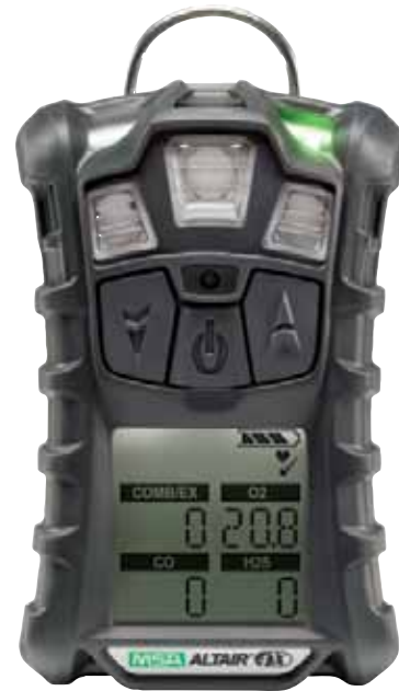
Part No. 10107602