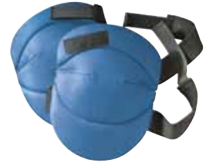
Part No. 0129