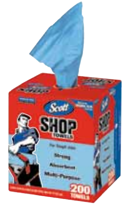
Part No. 75190