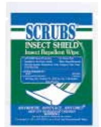
Part No. 91401