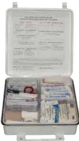
Part No. 6088