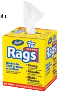
Part No. 75260