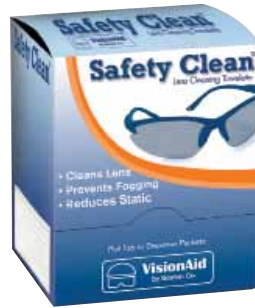
Part No. LCT100

Lensclean Liquid cleaners eliminate static with anti-fog solution and are silicone-free. Total compliance with OSHA standards. A heavy-duty, silicone-based anti-fog solution is also available.