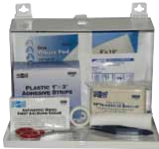
Part No. 6086