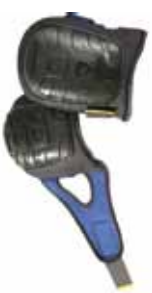
Part No. 0121