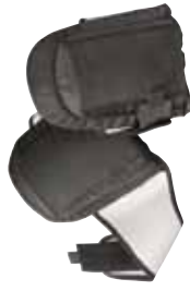
Part No. 0123