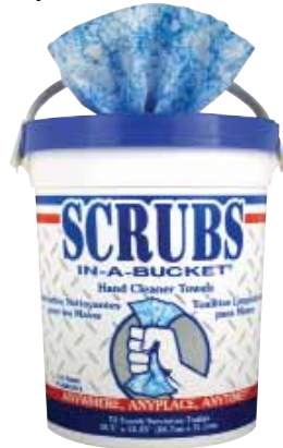
Part No. 42272