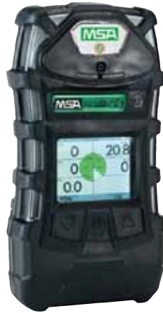
Part No. 10094919