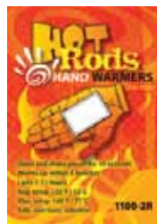
Part No. 1100-10R