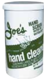
Part No. 401P

When Kleen Products decided to create Hand Scrub, the first consideration was to maintain the high level of quality expected from Joe's Products. The polyethylene scrubber is round and smooth, unlike jagged edges of pumice or sand. Subsequently, the scrubbing process is a safer, more gentle method. Treat your hands to Joe's Hand Scrub. Pumps sold separately.