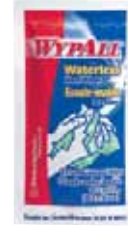
Part No. 91054