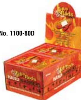
Part No. 1100-80D