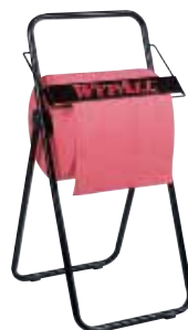
Part No. 80596

Part No. 73900- Access Wall Mounted Dispenser for Brag & Pop-Up Box.