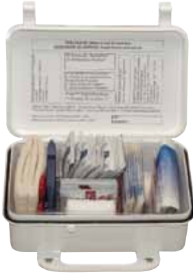
Part No. 6060