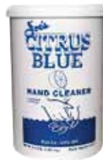
Part No. 501P

Formulated with natural d-Limonene solvent for safe cleaning, balanced skin conditioning, the fresh scent of citrus and a distinctive blue color. Pumps sold separately.