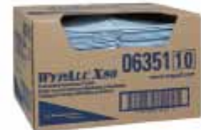
Part No. 06351