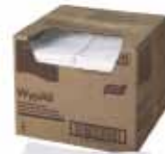
Part No. 05925

Foodservice Towel is versatile and reusable and ideal for all of your general cleaning needs. Strong yet soft cloth-like feel textured pattern helps trap and pick up food particles Durable and machine washable, rinses clean in sanitizing solution.