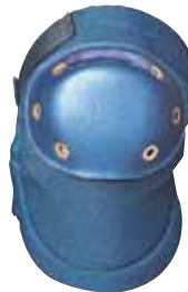
Part No. 0125