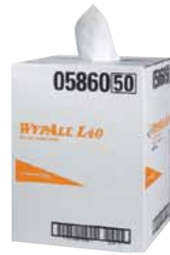
Part No. 05860