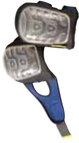
Part No. 0122