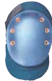
Part No. 0126