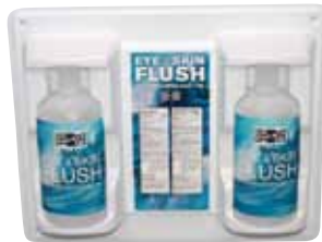
Part No. 24-102