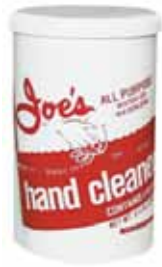
Part No. 101P

Joe's creamy formula liquefies and gently lifts grease, grime and stains from the hands safely and without water. Joe's leaves hands clean and conditioned, without the greasy feeling and strong odor of competitive brands. The lanolin and skin care emollients help rough, dry and overused hands. Pumps sold separately.