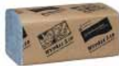
Part No. 05123

Part No. 05123 - Windshield Towel, qty 2240/cs