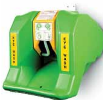
Part No. 01116